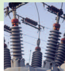
Fuel cell power plants offer environmental, operational, and economic benefits.